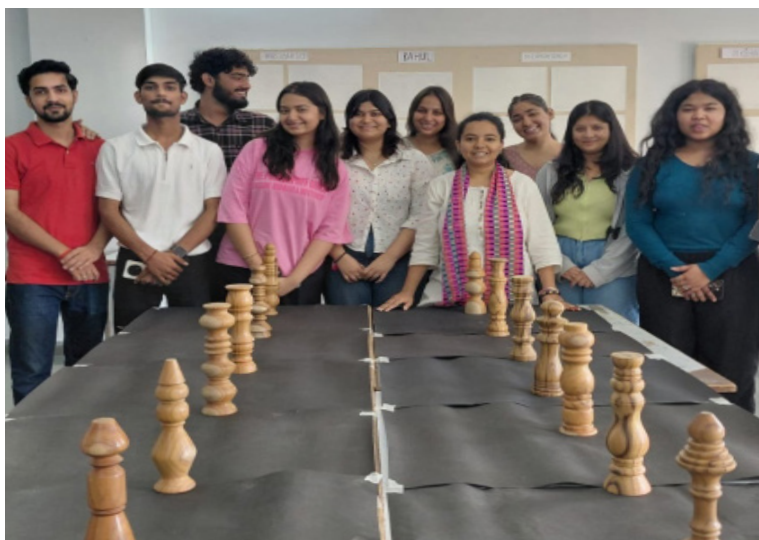
Second-year HMD students showcased their wood-turning work

Foundation Batch students presented a display based on the Elements of Design, showcasing their understanding of line, shape, form, colour, texture, space and value. The display served as a platform for presenting concepts and processes, while receiving feedback from peers and faculty. It encouraged critical thinking, visual articulation and collaborative learning.