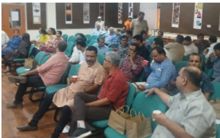
Diwali Milan organized at the IICD Conference Hall for staff and faculty members

As part of IICD's tradition on 17th October, a Diwali Milan was organized at the IICD Conference Hall. The celebration was followed by the distribution of Diwali gifts and refreshment for staff and faculty members.