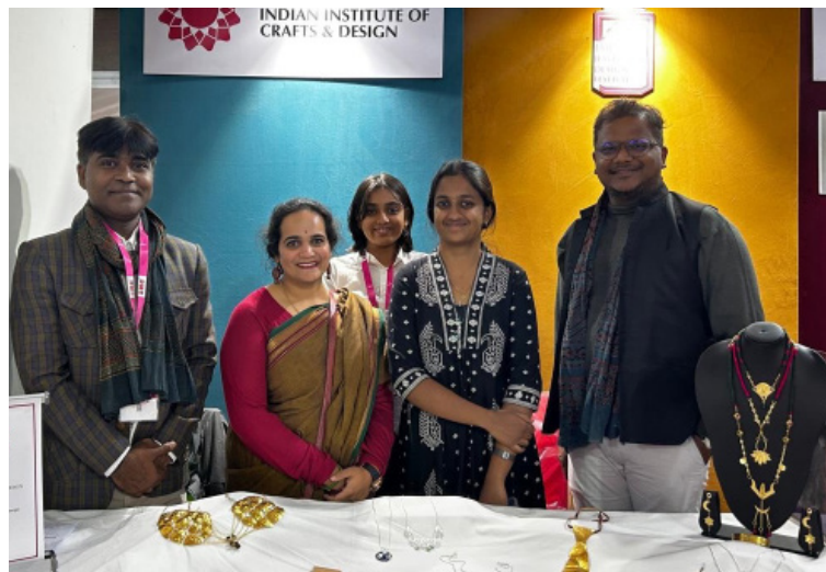
IICD faculty and student at JJS 2025

Their participation provided a valuable platform for industry exposure, enabling them to engage with designers, artisans, and business leaders while gaining firsthand insight into emerging trends and market dynamics in the jewellery sector.