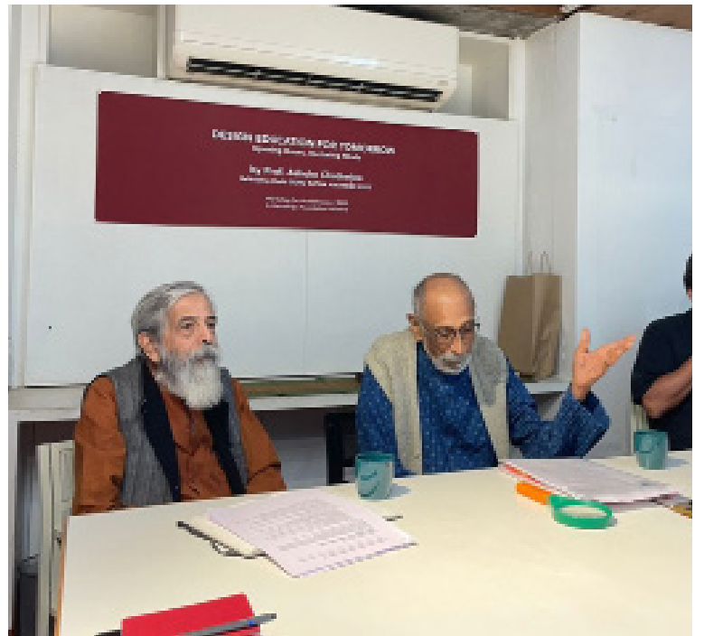
Focused discussion on curriculum innovation