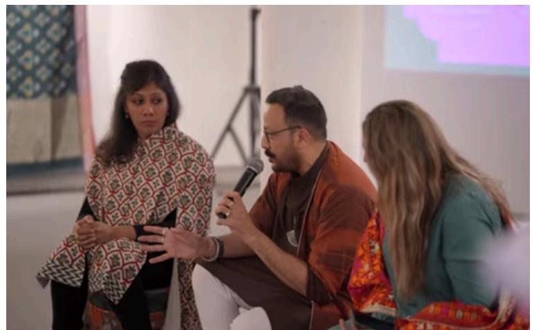
Insightful discussion on innovation in the craft sector

The conclave addressed sustainability through upcycling and circular economies, highlighting the balance between ethical production, affordability and market demand, alongside the role of storytelling, while emphasizing catalytic capital