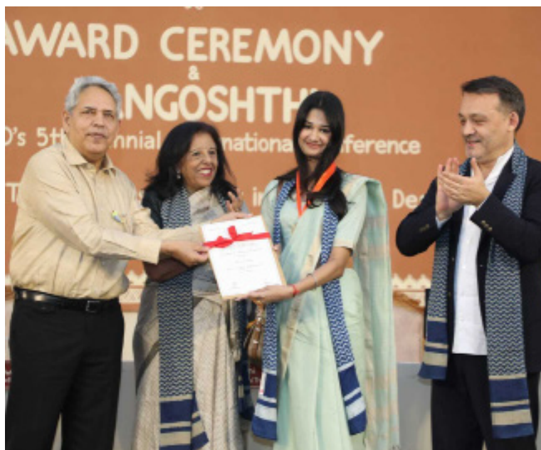
Distribution of Meritorious Students Awards

On the same occasion, the IICD Meritorious Student Awards were presented to graduating students in recognition of their outstanding academic performance and achievements during their course of study. The awards celebrated the dedication, creativity and hard work demonstrated by students across various programs at the institute.