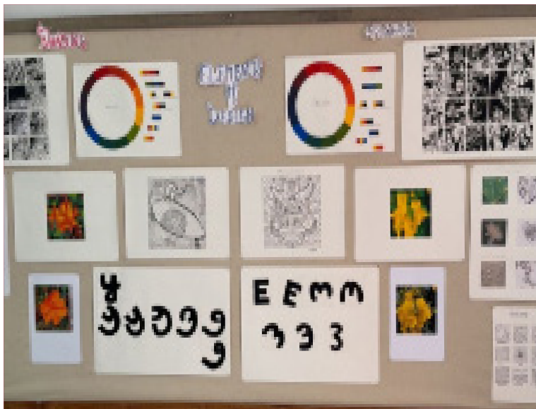
Foundation Batch students presented a display based on the Elements of Design

Foundation Batch students presented a display based on the Elements of Design, showcasing their understanding of line, shape, form, colour, texture, space and value. The display served as a platform for presenting concepts and processes, while receiving feedback from peers and faculty. It encouraged critical thinking, visual articulation and collaborative learning.