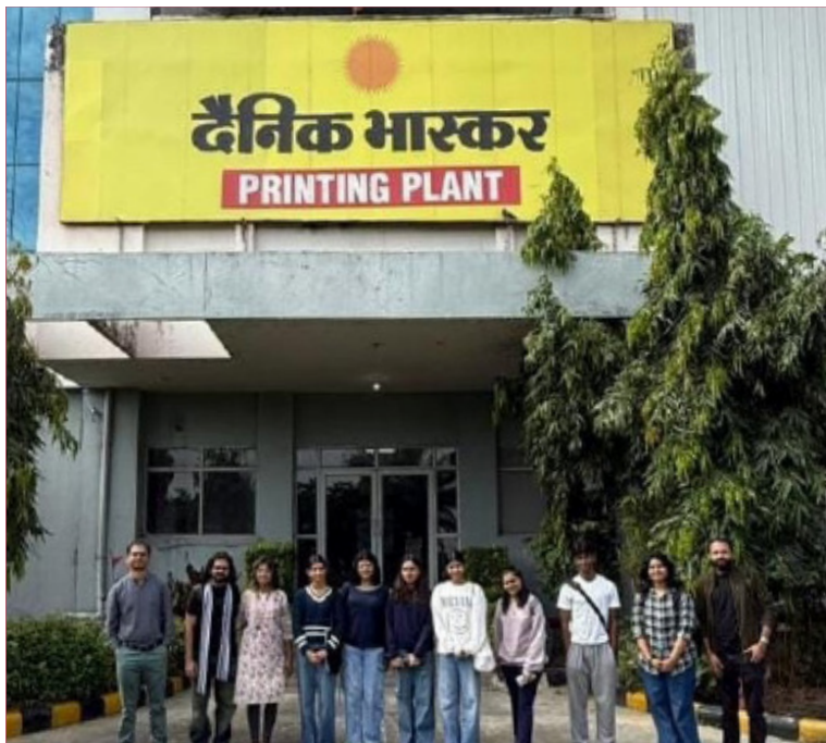
CCD students' visit Dainik Bhaskar Printing Plant.

A visit was organized for both UG and PG CCD students to the Dainik Bhaskar Printing Plant at Shivdaspura as part of the Digital Tools module. During the visit, students observed the complete workflow of a large-scale printing plant, gaining firsthand exposure to modern printing technologies and industrial processes.