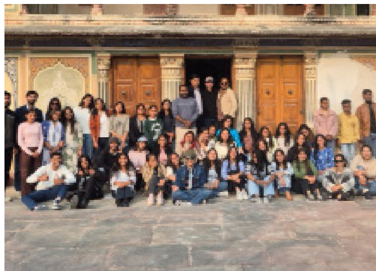
Foundation Year students' visit to Kunda Village

On 24th November 2025, Foundation Year students visited Kunda Village to explore the pottery and Udaipuria leather clusters. The visit aimed to provide direct exposure to traditional craft practices and artisan working environments. At the pottery cluster, students observed clay shaping on the potter's wheel and learned about stages such as preparation, forming, drying and firing. At the leather cluster, they explored processes including cutting, stitching, embossing and finishing.