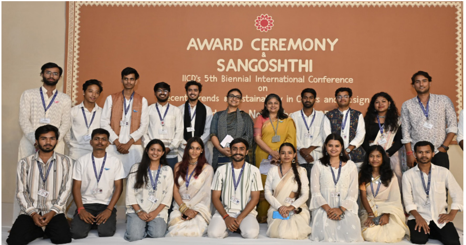
Artisan Wards after the conversation in an Open House Discussion during Sangoshthi

IICD's biennial conference Sangoshthi 2025 was successfully organized from 2nd to 4th November 2025, bringing together academicians, industries, artisans, students and stakeholders to engage in meaningful dialogue on the evolving landscape of crafts and design.