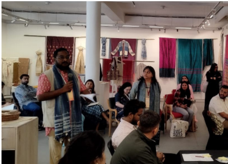
Discussion on challenges in the craft sector at Kula Conclave 2025

KULA Conclave 2025 emerged as a significant platform for rethinking the future of India's craft ecosystem, bringing together artisans, designers, investors, policymakers and academic institutions. Anchored in the theme "Trendspotting for 2030: Going Local for Global," the conclave addressed the urgent need to strengthen India's largely informal, artisan-led economy through innovation, inclusive capital and collaborative frameworks.