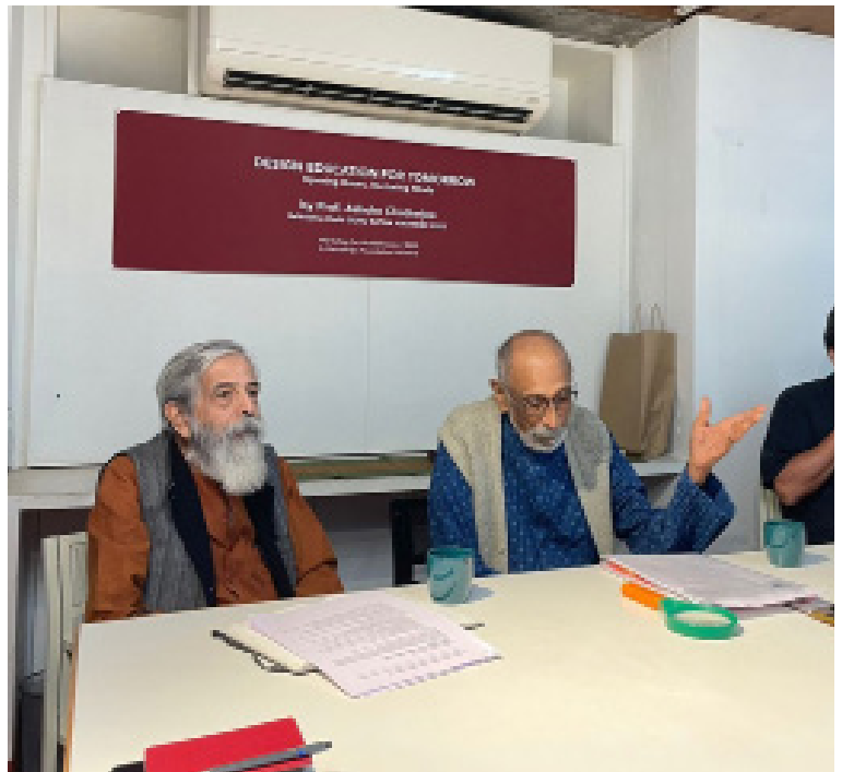
Focused discussion on curriculum innovation