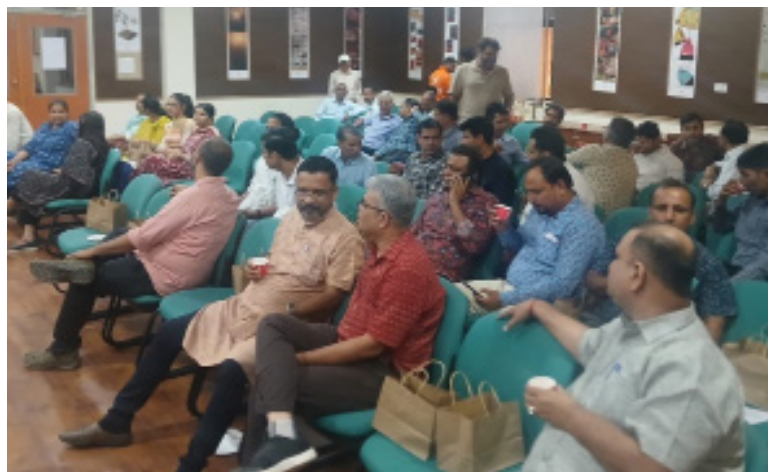
Diwali Milan organized at the IICD Conference Hall for staff and faculty members

As part of IICD's tradition on 17th October, a Diwali Milan was organized at the IICD Conference Hall. The celebration was followed by the distribution of Diwali gifts and refreshment for staff and faculty members.