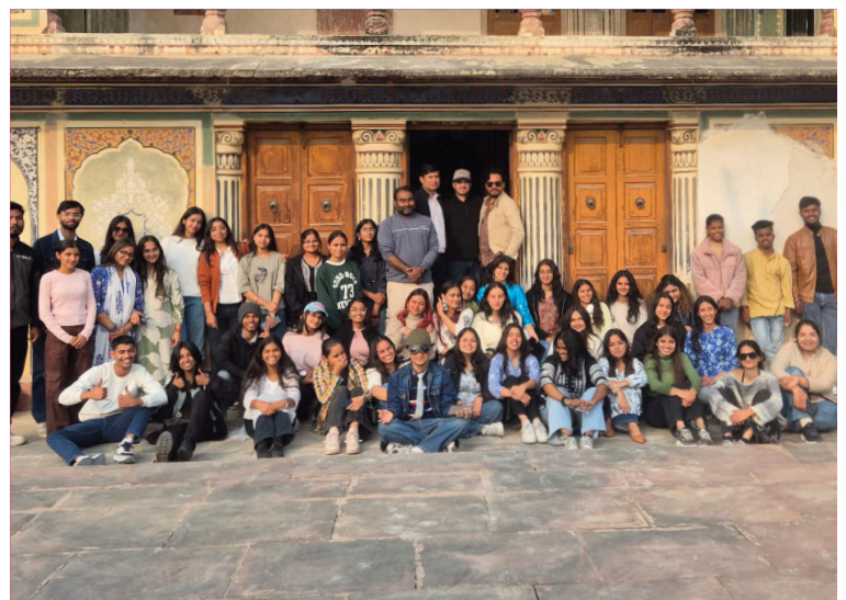
Foundation Year students' visit to Kunda Village

On 24th November 2025, Foundation Year students visited Kunda Village to explore the pottery and Udaipuria leather clusters. The visit aimed to provide direct exposure to traditional craft practices and artisan working environments. At the pottery cluster, students observed clay shaping on the potter's wheel and learned about stages such as preparation, forming, drying and firing. At the leather cluster, they explored processes including cutting, stitching, embossing and finishing.