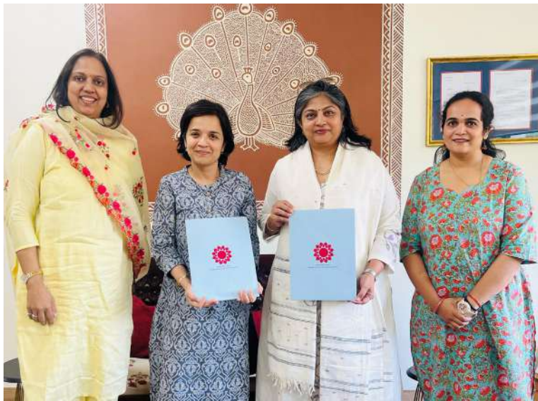
A strategic partnership to empower craft-based entrepreneurship and bridge design with business innovation