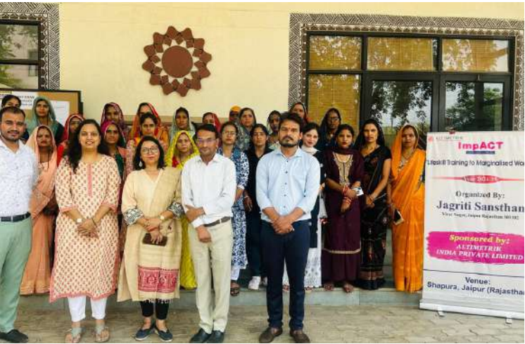
IICD Hosts Educational Visit for Women Participants from Shahpura

IICD hosted an educational exposure visit on 6th June for 30 women participants from Shahpura under Jagriti Sansthan’s Life Skills Training Program. The visit offered hands-on exposure to traditional and contemporary crafts through live demonstrations in stitching, block printing, and embroidery. Interaction with design professionals introduced income-generating opportunities, motivating participants towards self-employment and entrepreneurship in the craft sector.