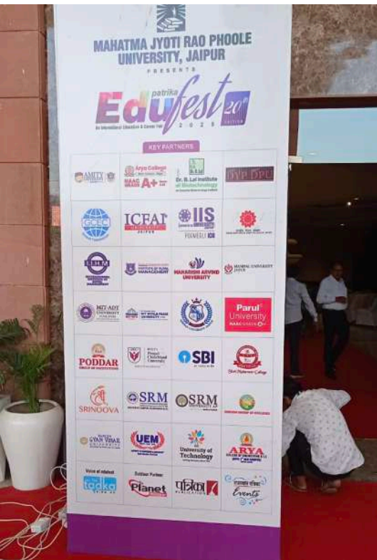
IICD at Edufest 2025, Showcasing Craft-Centered Design Education

Indian Institute of Craft and Design participated in the Edufest 2025 event, organized by Rajasthan Patrika from 16th to 18th May at the Rajasthan International Centre (RIC), Jaipur.