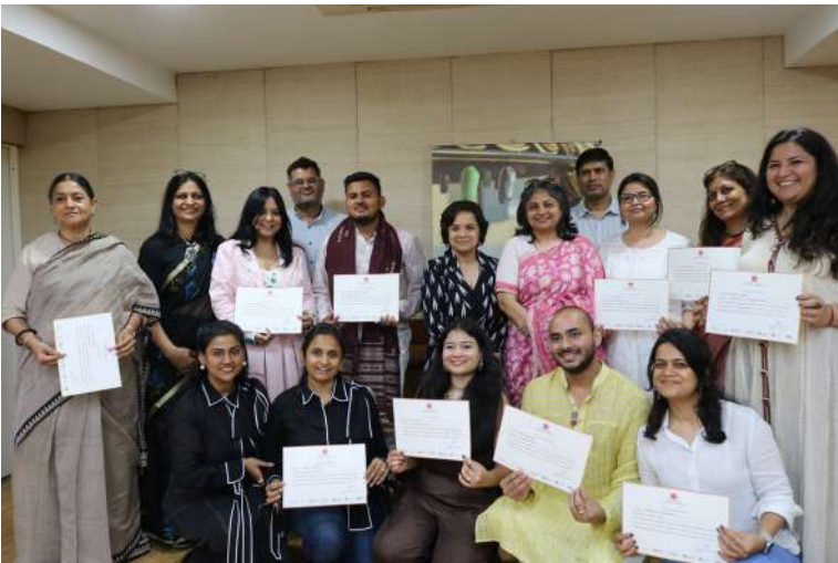
Honoring the journey of 12 entrepreneurs and their vision for a craft-led future.

Throughout the program, participants received individual mentorship and handholding support tailored to their specific business needs.