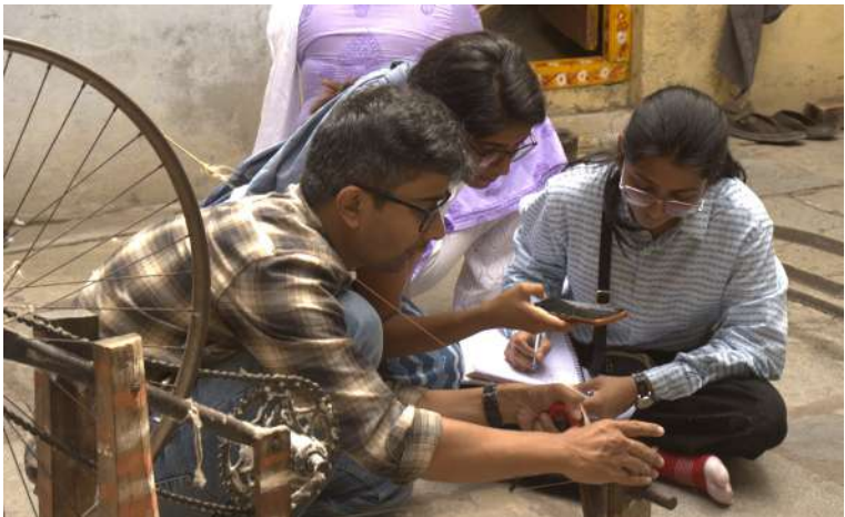
IICD students exploring various tools during field research work

and lived experiences. These interactions provided insights into challenges faced by craft communities today, including livelihood sustainability, market access, and intergenerational knowledge transfer.