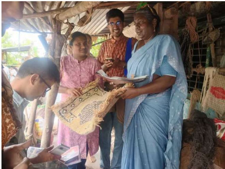
IICD faculties and students exploring vertical loom weaving

The project aims to create a holistic record of Telangana's craft traditions by exploring their historical evolution, contemporary practices, production processes, and the socio-economic realities of artisan communities.