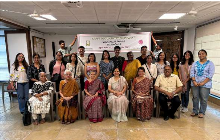
IICD faculties and students with members of Crafts Council of Telangana

This initiative will culminate in a comprehensive publication systematically documenting Telangana's traditional crafts. It is envisioned as a lasting academic and cultural resource for scholars, designers, policymakers, and practitioners, contributing to craft preservation, cultural sustainability, and artisan empowerment.