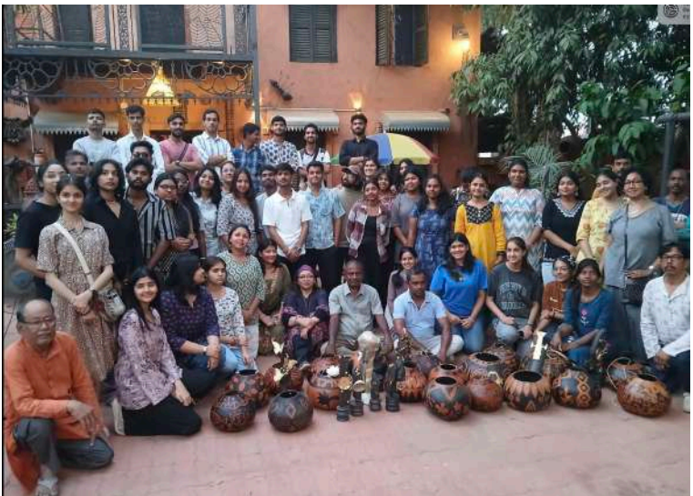
UG Foundation students, faculties & local artisans with the Tumba craft

From Tumba and Sholapith to seed ornaments and brasswork, the crafts explored during the workshop were just the tip of the iceberg – each representing layers of Bengal's rich cultural and artistic heritage. The workshop, organized in collaboration with local artisan communities and hosted amidst the serene environs of Visva-Bharati University, allowed students to engage hands-on with materials, processes, and the philosophies behind each craft.