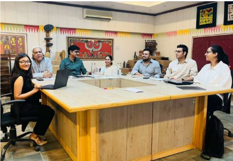
IICD celebrates a strong placement season for 2025 graduates

Out of 76 eligible students, 35 appeared for placements, with many securing offers from leading names in the craft, fashion, and interior design sectors. Notable recruiters included Injiri, Rajesh Pratap Singh, Princess Diya Kumari Foundation, Mangalam Arts, Urbania, Life Space Interiors, and Citta India. Companies like Kesula and Samiir Wheaton also made impactful hires, highlighting the institute’s growing industry network.