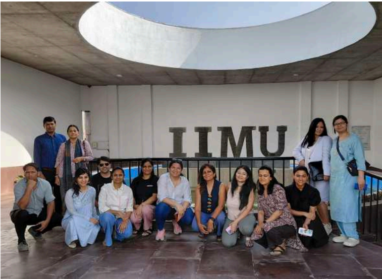
Participants of the IICD Crafts Business Accelerator Program 2025 during their immersion at IIM Udaipur

The second module of the Crafts Business Accelerator Program at IIM Udaipur provided participants with valuable exposure to a premier management and incubation ecosystem. The setting enabled meaningful engagement with experts on legal, financial, marketing, and scaling strategies, while field visits enriched learning through real-world craft and retail contexts. Hosting the module at IIM Udaipur strengthened industry-academia linkages and equipped craft entrepreneurs with practical tools to build sustainable, market-ready enterprises.