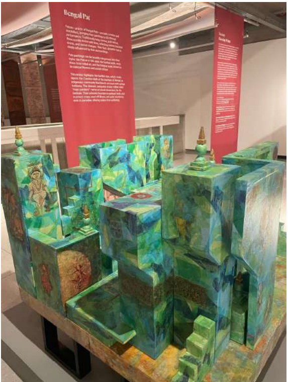
Craftwork by Amrita Sudan displayed at the 'Flowing Heritage' exhibition.

IICD alumna Amrita Sudan's work was prominently showcased at the 'Flowing Heritage' exhibition in Delhi on 10th April, celebrating the revival of traditional Indian crafts.