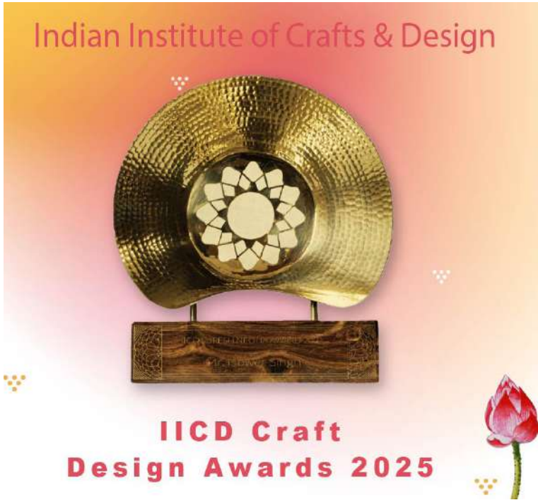
IICD Craft Design Awards 2025

The Indian Institute of Crafts and Design (IICD), Jaipur on 8th April announced the opening of entries for the IICD Craft Design Awards 2025, a prestigious platform celebrating innovation and excellence in Indian crafts. The annual awards invite designers, artisans, craft-based entrepreneurs, and students from across India to showcase their creative synergy of tradition and contemporary design, highlighting work that preserves and uplifts the country’s rich craft heritage.