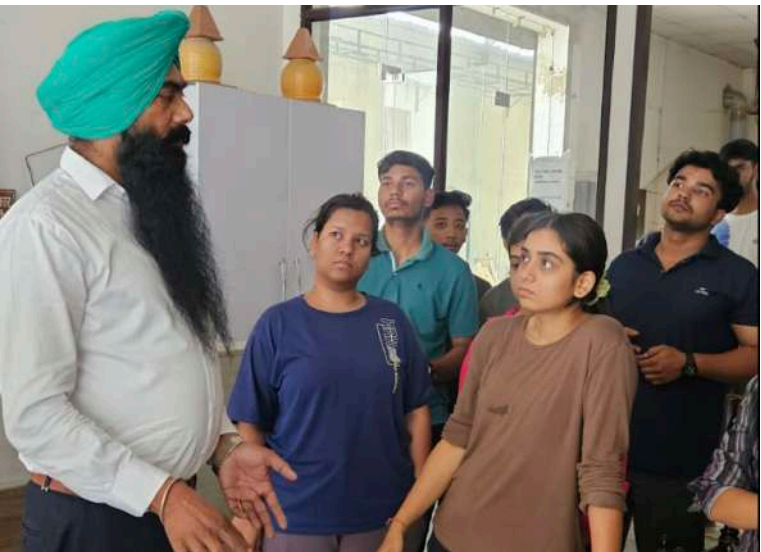
Students interacting with artisans, learning traditional craft practices firsthand.

They studied museum architecture, traditional metal and wood crafts, and Tibetan Buddhist metal embossing, engaging closely with artisans and communities through immersive field interactions, documentation, and reflective discussions.