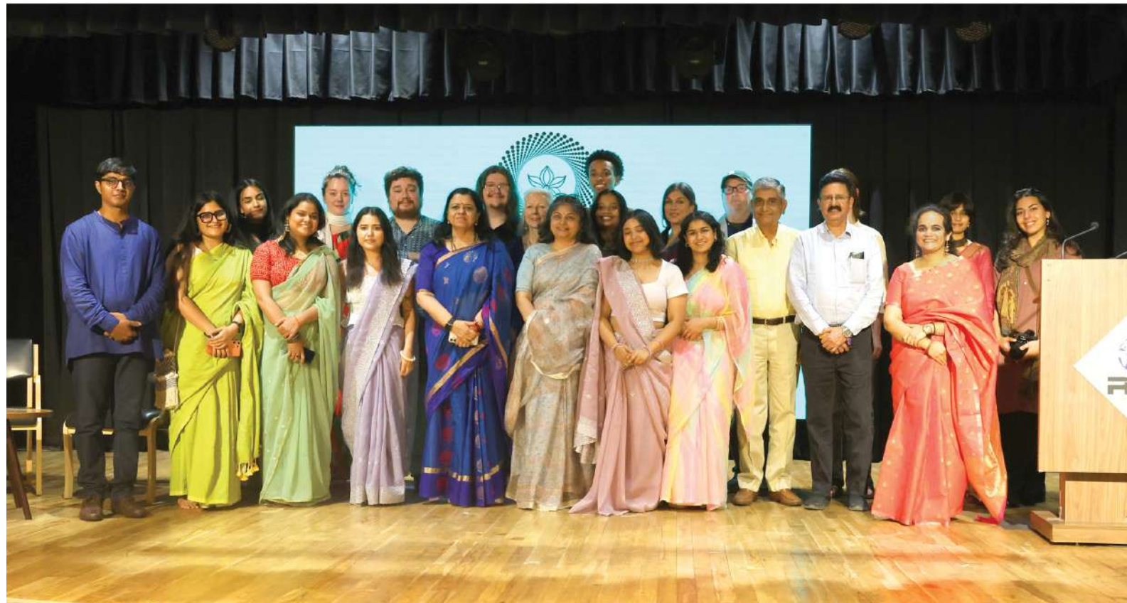
Crafts, Camera, Culture 2025 Craft Documentaries Film Screening on 2nd July 2025 at Rajasthan International Center, Jaipur

On 2nd July 2025, the five-week documentary film making programme held in June 2025 concluded with an inspiring and artfully curated screening at RIC; Rajasthan International Centre, Jaipur. Hosted by the Indian Institute of Crafts & Design (IICD) in collaboration with Michigan State University (MSU) and West Dean College, UK, the third edition of Crafts, Camera, Culture once again celebrated creativity, collaboration, and the living heritage of Indian crafts.