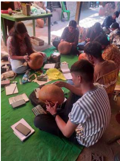
Students learning Tumba craft

From the 1st to 6th April 2025, UG Foundation students participated in an enriching crafts workshop held at the culturally vibrant Shantiniketan.