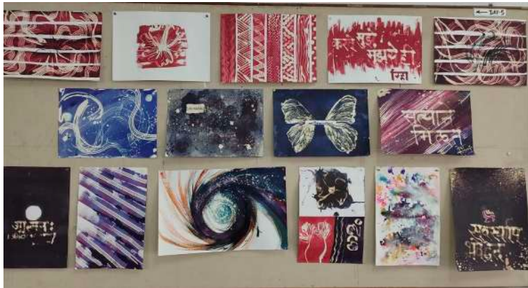
Hand Lettering & Calligraphy Exhibition: A showcase of typographic expression and skill