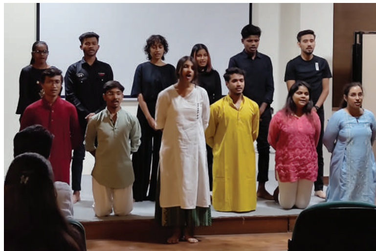
Students performing for Gandhi Jayanti & Shastri Jayanti