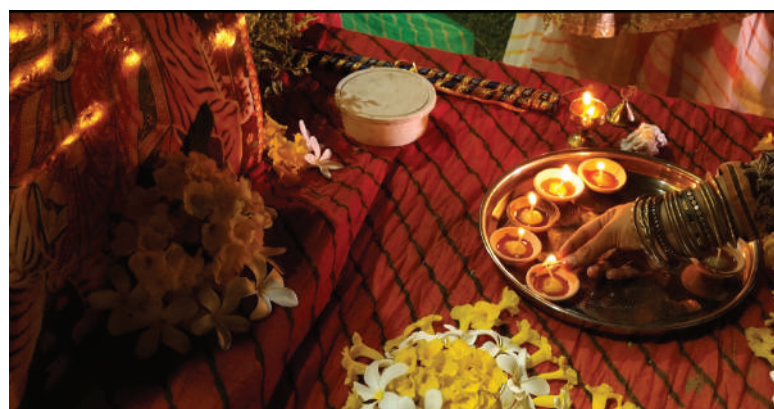
Navratri Celebrations at IICD

IICD radiated with joy during Navratri. The campus transformed into a vibrant hub with colourful decorations, and spirited Garba and Dandiya performances. The event started with prayers to Goddess Durga, followed by prasad distribution and the commencement of Garba performances. Each day concluded with awards for the best male and female performers.