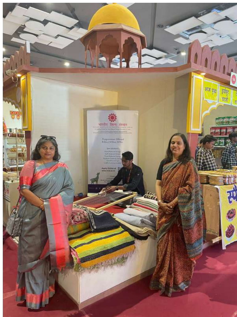
The Director and Manager-Projects IICD at the event venue

IICD was invited to participate in the IITF 2023 by the Government of Rajasthan which was organised at Pragati Maidan from 14 November to 27 November 2023. In the Rajasthan pavilion of state Government at the event, IICD was assigned the