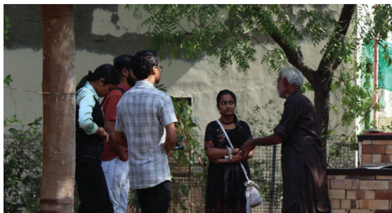
Students interacting with weaver, at Khamir Museum, Kutch

Students pursuing B.Des in Craft Communication Design, Soft Material Design, and Fashion Design embarked on a journey to Bhuj from 2nd - 6th December, 2023. Throughout the excursion, they explored the Living and Learning Design Centre Museum, Kala Raksha, Khamir, and Hodka village to delve into Leather Craft and Bead Work. The itinerary also encompassed a visit to printing units in Ajrakhpur, providing them with hands-on experience in Ajrakh Printing and a comprehensive understanding of its intricate process.