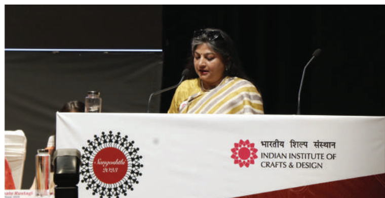
Director of IICD addressing the audience