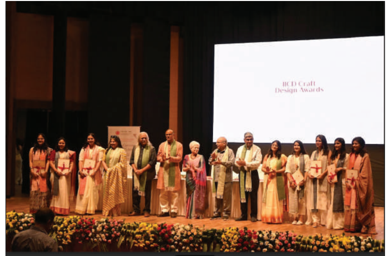
A still from the Award Ceremony of the Meritorious Student Awards

These students have not only demonstrated academic excellence but have also showcased the intellectual prowess and dedication that sets them apart on a global stage. They have embodied the spirit of inquiry, critical thinking, and innovation that IICD as an institution values and encourages.