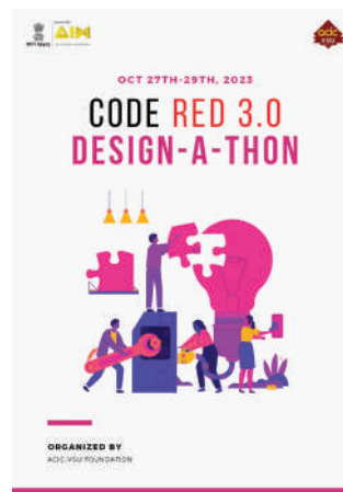
The poster for Code Red 3.0 Design-a-thon.