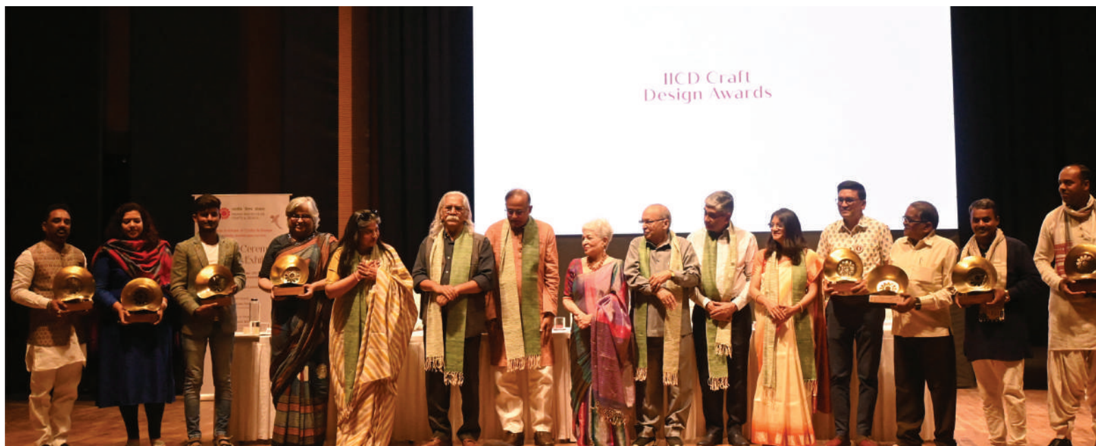
Craft Design Awardees with the dignitaries at Sangoshthi